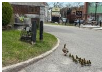
Special guests passing through!