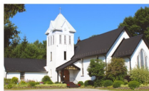
St. Luke, Price's Corners