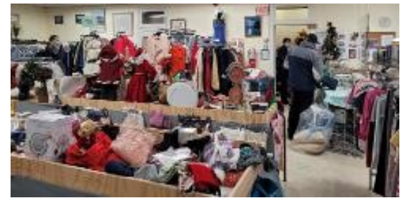
Pennywise Thrift Shop was open for shoppers as well.